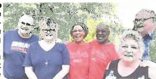
Pictured on this page are just some of our guests from the spring and summer of 2020.